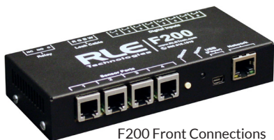
F200 Front Connections